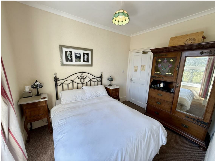
Rear window, radiator