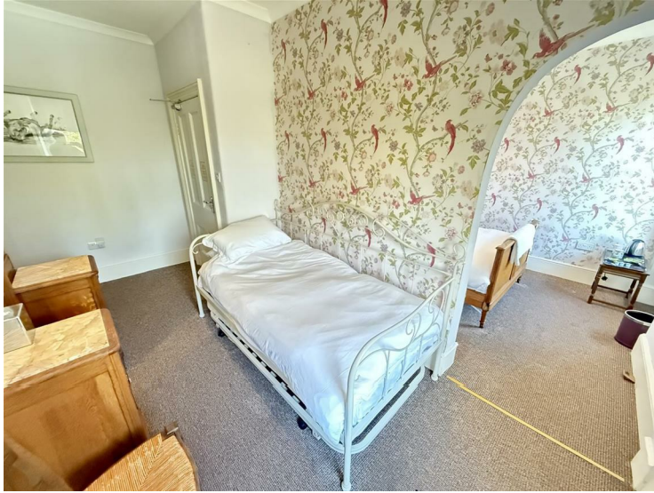
Radiator, front window