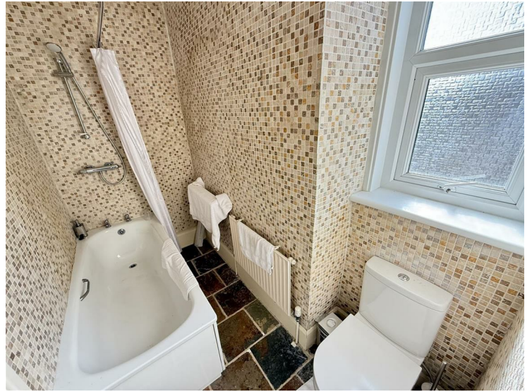
Being fully tiled with bath having shower unit over, radiator