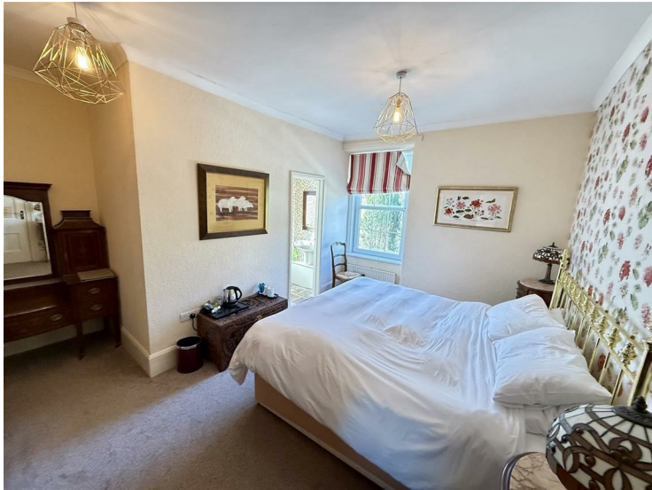
Front window, radiator

15' x 14'6" overall (inc, ensuite) (4.57m x 4.42m overall (inc, ensuite))