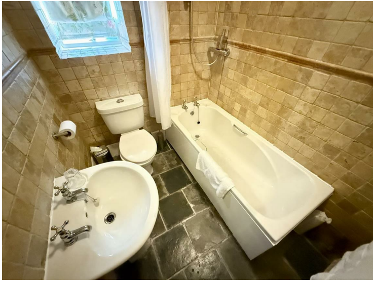
Being fully tiled with bath having shower unit over, wash hand basin, toilet, radiator