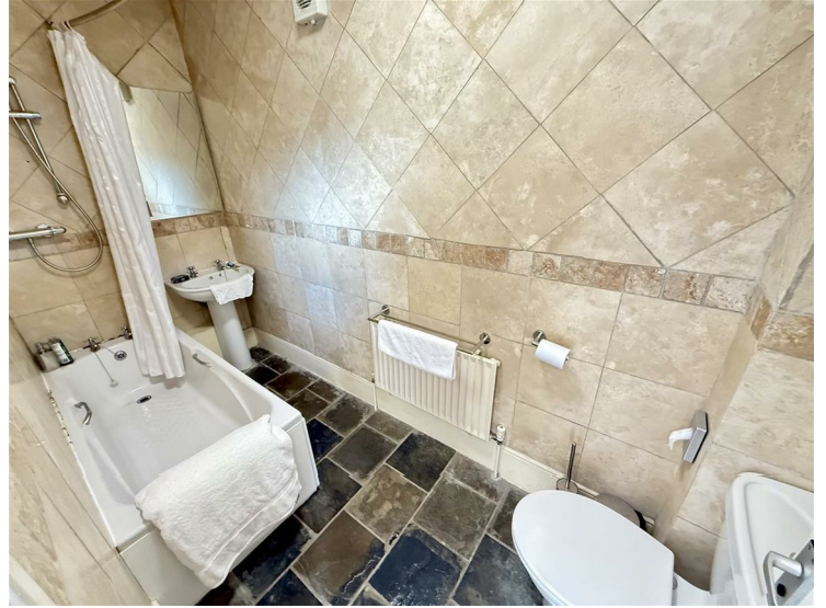
Fully tiled with bath having shower unit over, wash hand basin, toilet, radiator