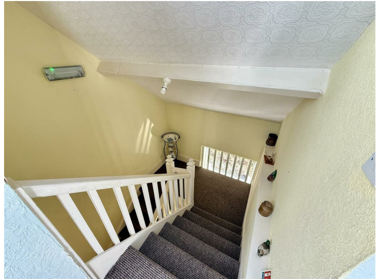
With velux roof windows, access to understairs storage area