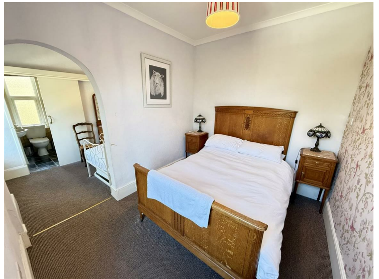
With radiator, front window, door to-

14'10" x 9'8" overall (4.52m x 2.95m overall)